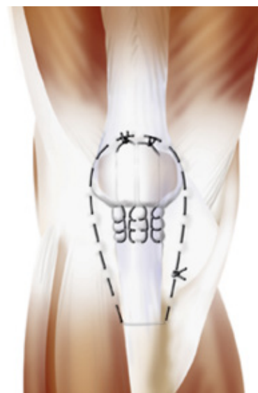
Figure 2. Front view of knee after patellar tendon repair. The primary sutures repair the torn tendon and the relaxing suture encompasses the repair and goes around the patella, providing initial protection to the repaired portion of the tendon.

Surgical repair is usually necessary to obtain the optimal outcome for large, partial tears and complete ruptures. Most often the torn tendon is re-attached to the knee cap by passing the tendon through drill